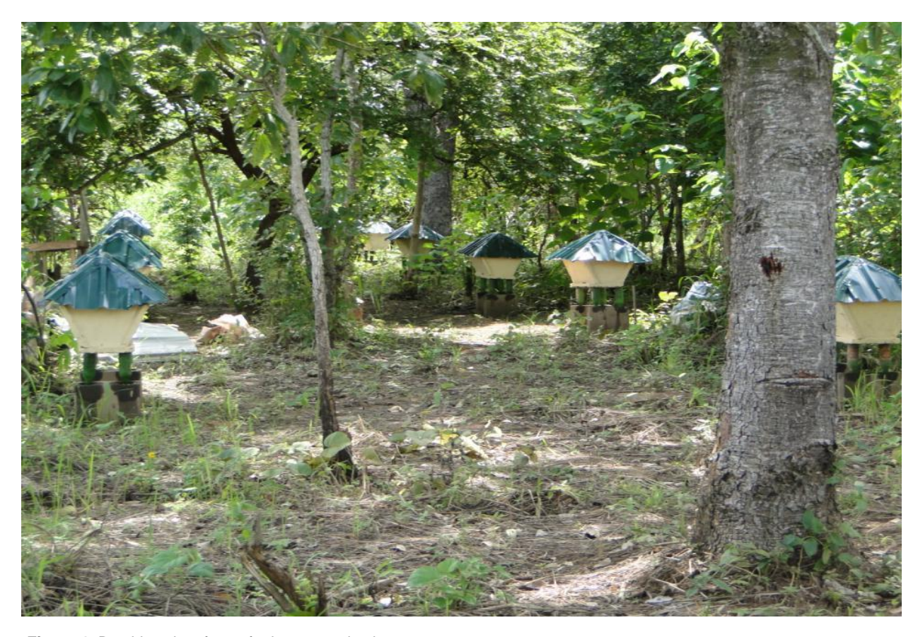
Figure 1. Bee hives in a forest for honey production.