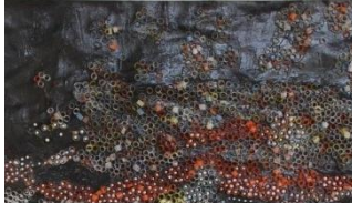
Fig. 5 - Study for Strata