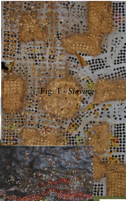
Fig. 1 - Sieving