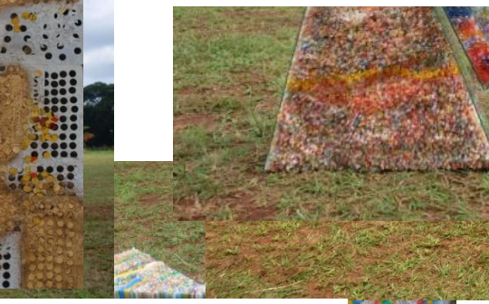
Fig. 6 - Strata-Concord II