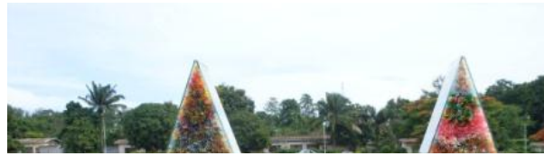
Fig. 2 - Defining the Space Within, 2007